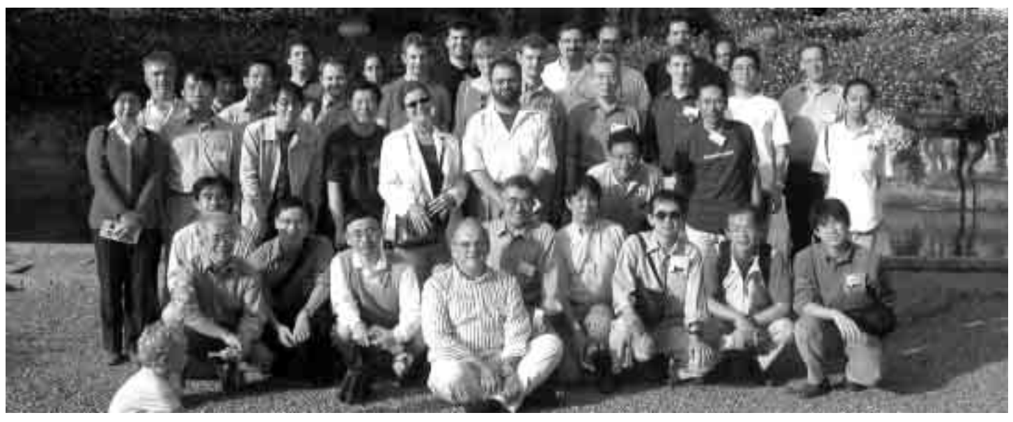
Participants in the 4th Asia-Europe Workshop in Lucca, Italy.